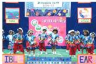
Classes Nursery & LKG Pratibha Darshan – Incredible Earth