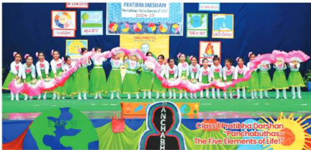
Class I Pratibha Darshan "Panchabuthas - The Five Elements of Life!"