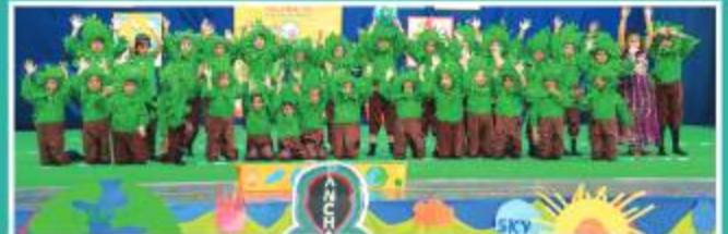
Prakriti Ka Soundarya