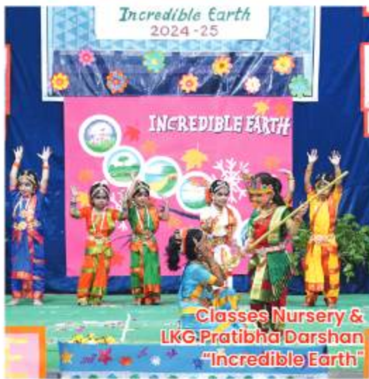
Classes Nursery & LKG-Pratibha Darshan "Incredible Earth"