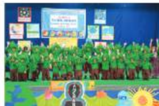
Class 1 Pratibha Darshan – Panchabhutas-The Five Elements of Life!