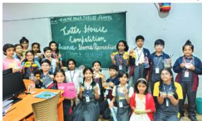
Home Remedies Competition