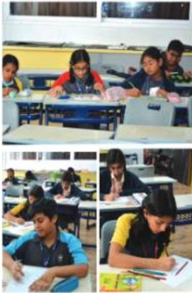
Fun with Numbers