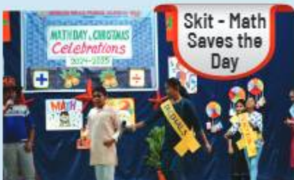
Skit - Math Saves the Day