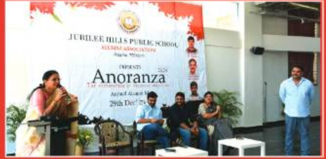
Formal Meet- Address by Director