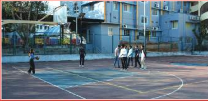
Back to PE Class