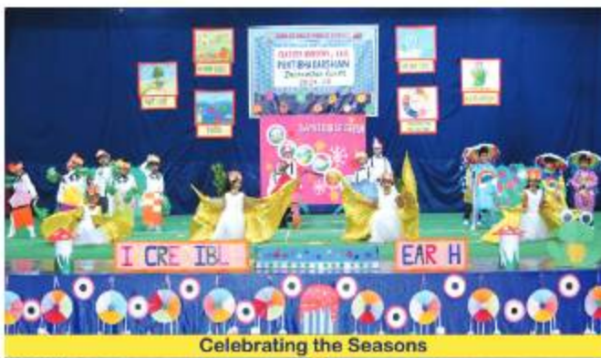
Celebrating the Seasons