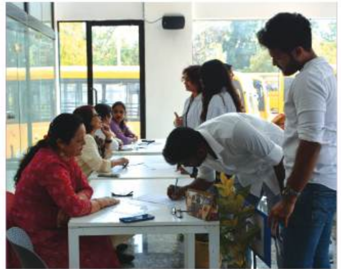
At The Registration Table