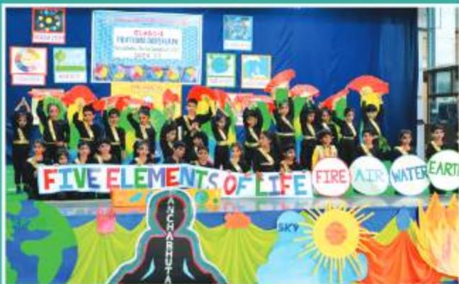
The Energy of Life