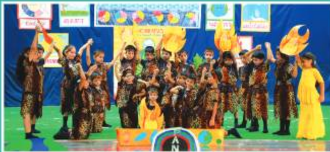
The Precious Flame