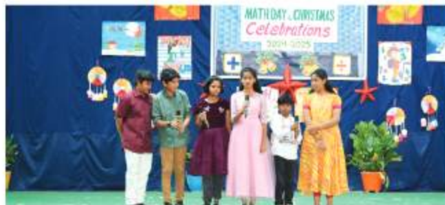
Song - Christmas celebrations