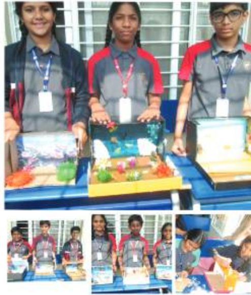
Save The Planet