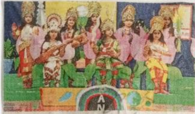
Eenadu - 10-12-2024