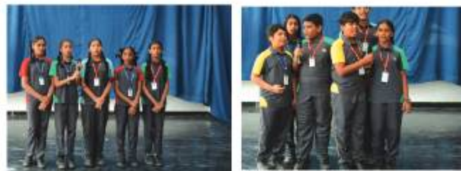
Rendition of Patriotic Songs