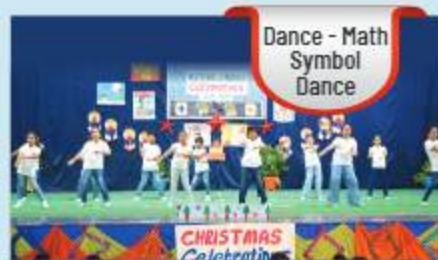
Dance - Math Symbol Dance