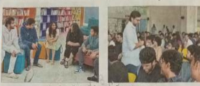
జూబ్లీహిల్స్ పబ్లిక్ స్కూల్లో సందడి చేస్తున్న పూర్వ విద్యార్థులు