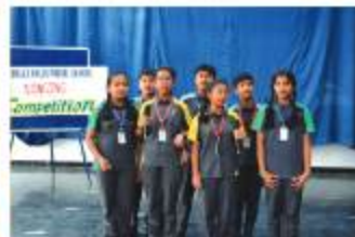
Class VII Inter Class Singing Competition