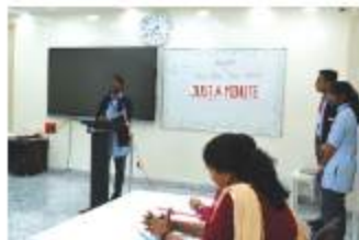
Just A Minute – Inter Class Competition for Senior Secondary