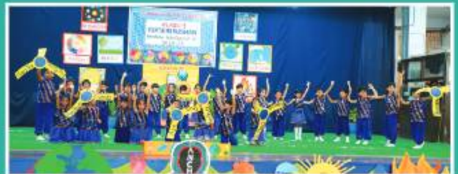
Vaayu Ka Mahatv