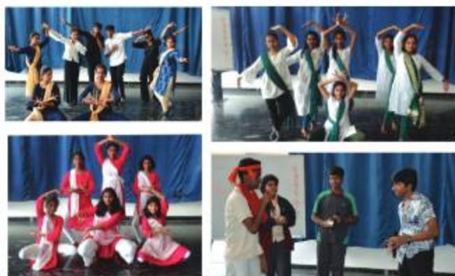
Skit and Dance Competition