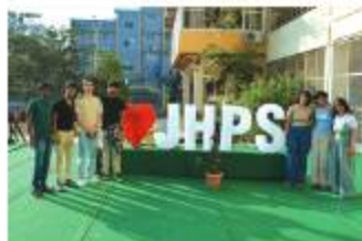
Alumni Meet 2024