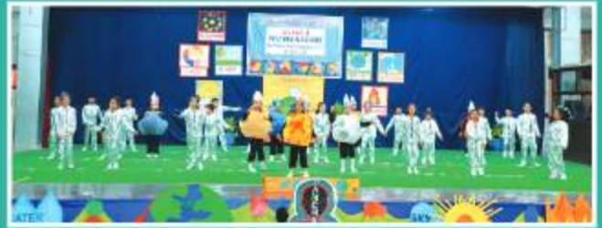
The Solar System