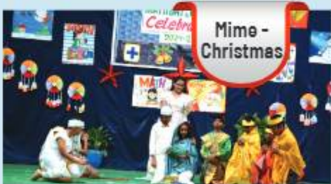
Mime - Christmas