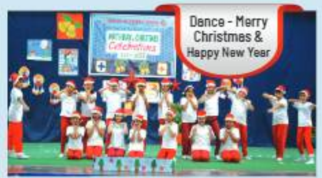
Dance - Merry Christmas & Happy New Year