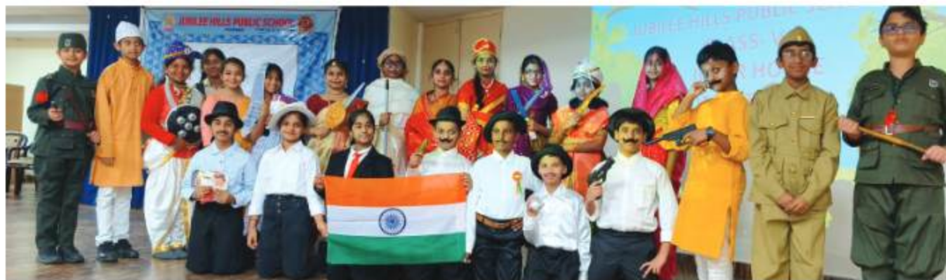
Role Play Competition

cultural issues to life, blending humour and drama seamlessly. The album-making activity encouraged participants to weave memories and experiences together through vivid visuals and engaging storytelling while the budding journalists demonstrated their knack for reporting and designing in the newspaper activity, producing stunning layouts and insightful content that highlighted the spirit of the event. The activities fostered a sense of camaraderie and healthy competition among students, encouraging teamwork and leadership, leaving everyone inspired and motivated to explore their creative horizons further.