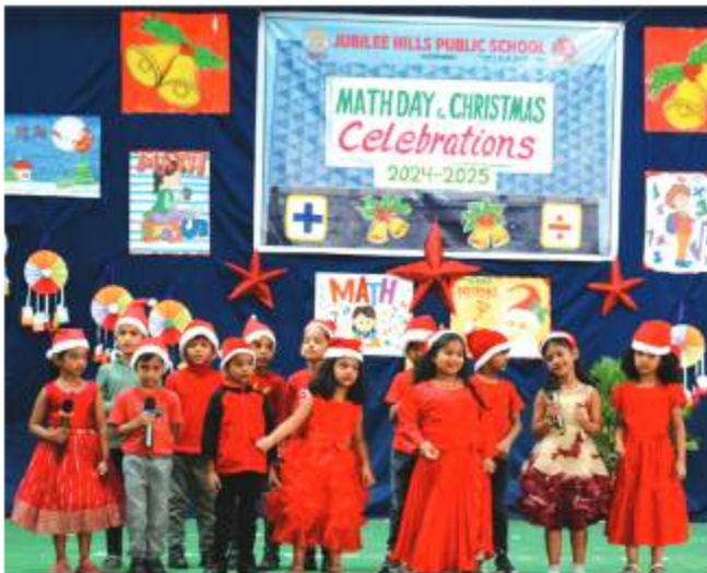
Pre Primary Christmas Song

In addition to the Christmas festivities, the school also honored Math Day, a special occasion to recognize the beauty of mathematics and its importance in our daily lives. Students showcased the importance of the day through various activities, from math-based games to creative demonstrations, showing their passion for the subject and the endless possibilities it offers. As the celebrations concluded, everyone left with a sense of warmth, joy, and renewed commitment to learning, ready to embrace the opportunities the New Year will bring.