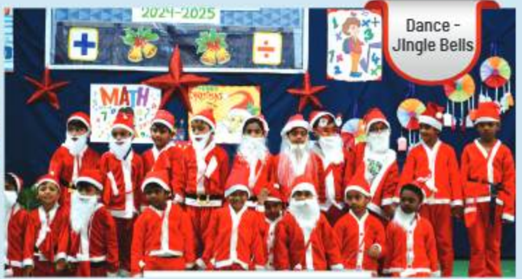
Dance - Jingle Bells