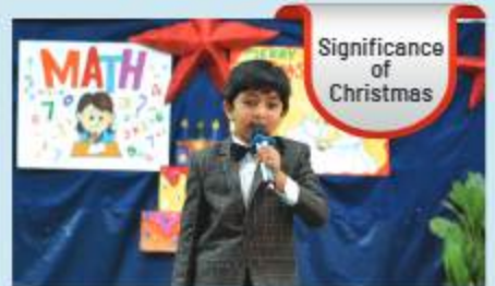
Significance of Christmas