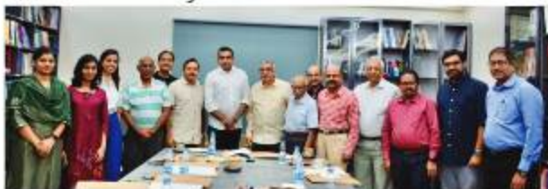
JHES Managing Committee Members

Jubilee Hills Education Society is established in 1986 and is running two prestigious schools in Telangana and is planning to establish more schools in Telangana.