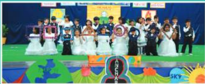
The Radiant Star