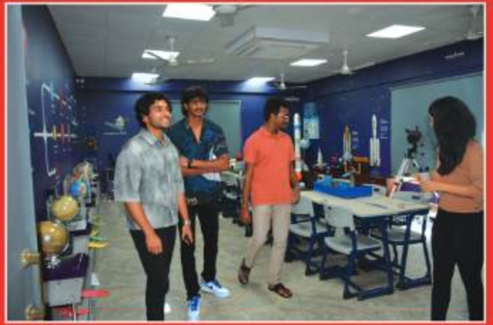
Alumni's Walk Down the Memory Lane