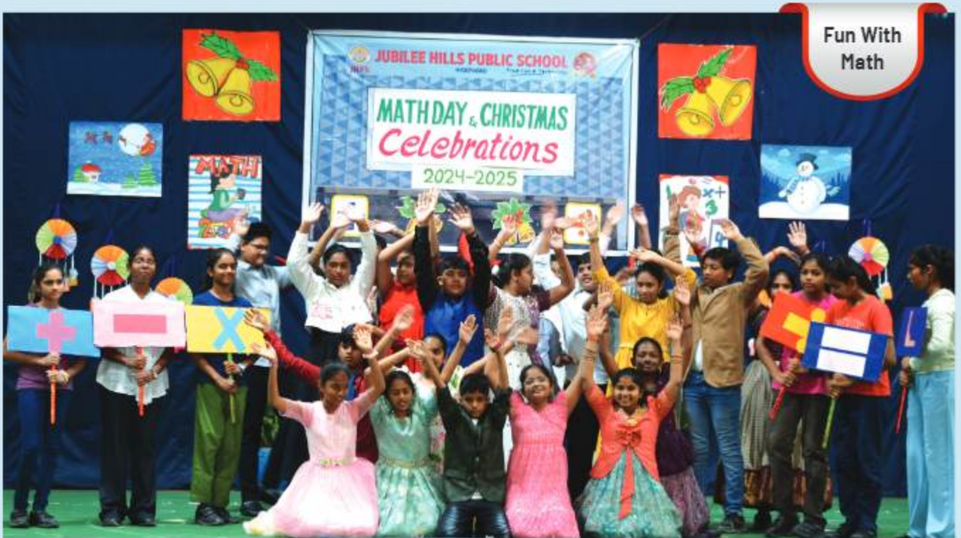
Fun With Math