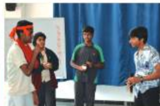
Inter House Activities