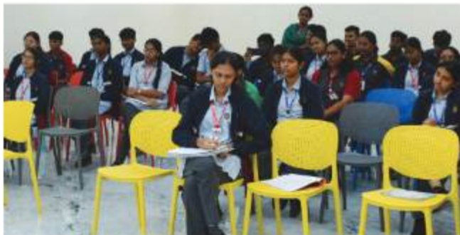
Eloquent Speeches Delivered by Participants