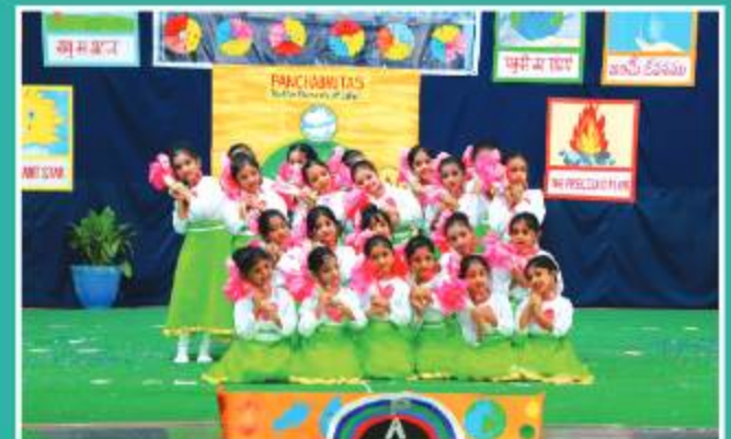
Finale - Rhythmic Beats