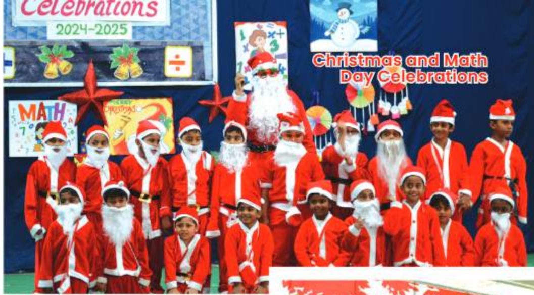
Christmas and Math Day Celebrations