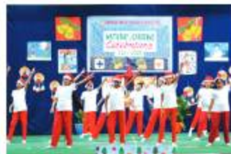
Christmas and Math Day Celebrations