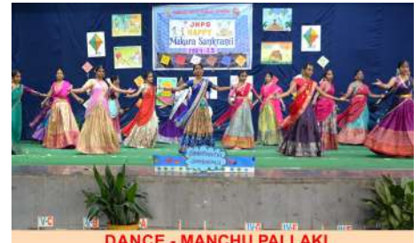
DANCE - MANCHU PALLAKI