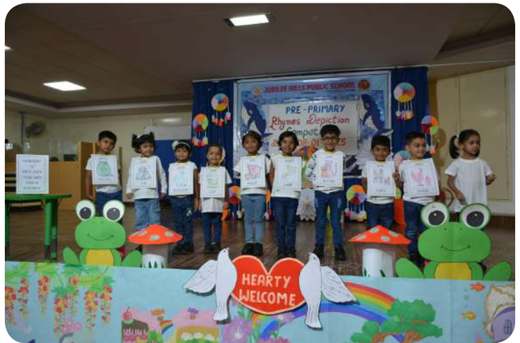
The Hen has a Chick

The students depicted rhymes on variety of topics like nature, animals, food, good manners and environment. Judges were invited to witness and evaluate the competitors. They appreciated and applauded the performance of the students. The competition proved to be tough and exciting where the students performed with great zeal and enthusiasm.