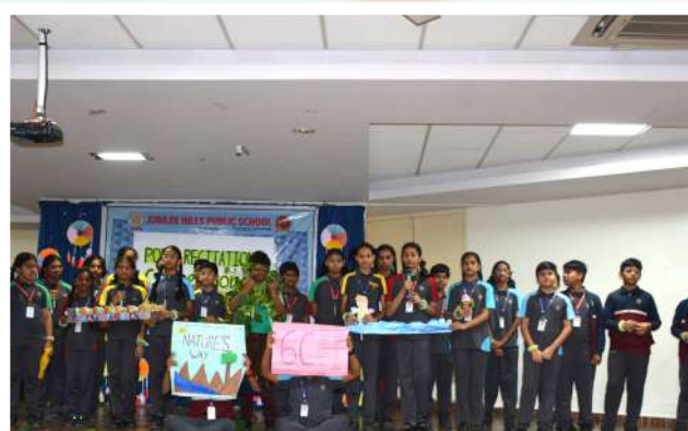
Poetry Recitation Competition