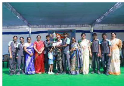
Godavari Overall Best House 2