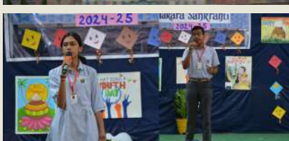
SIGNIFICANCE OF NATIONAL YOUTH DAY