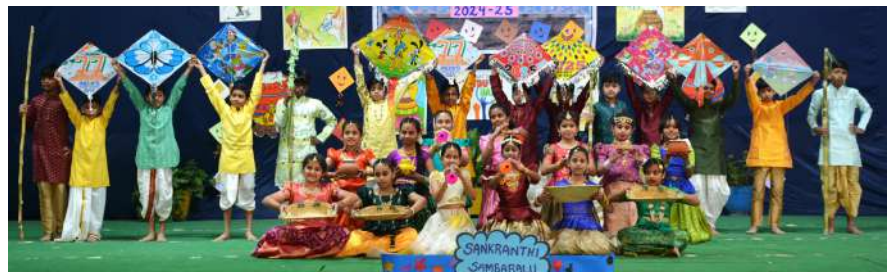
Dance - Sankranti Bommala Koluva