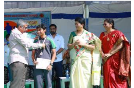
Class 9 Math Topper Award