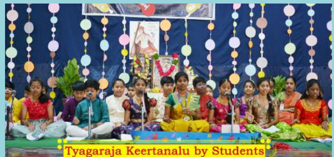
Tyagaraja Keertanalu by Students