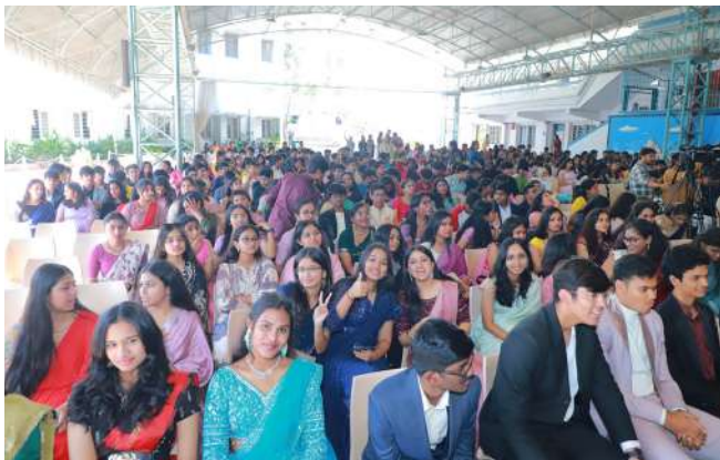
Students in their Glamorous Attire