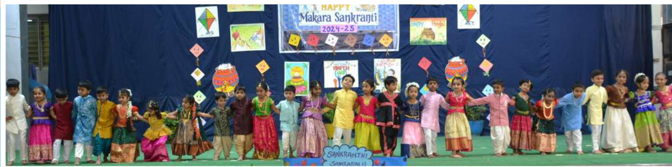
Sankranti and National Youth Day Celebrations