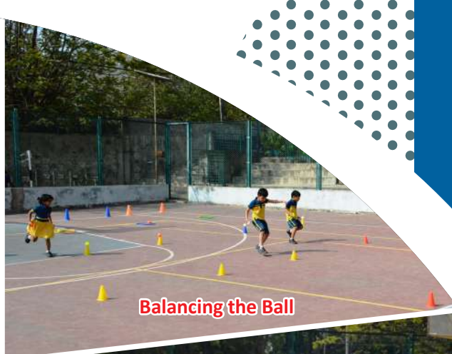
Balancing the Ball