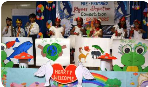
Save the Earth