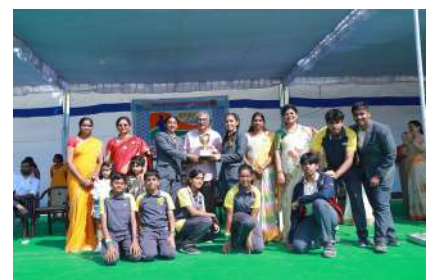
Best House in Sports Krishna Second Place