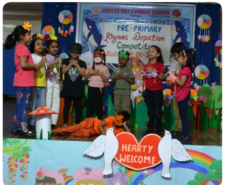
Walking in the Jungle