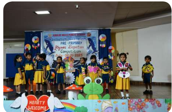
Five Little Ducks