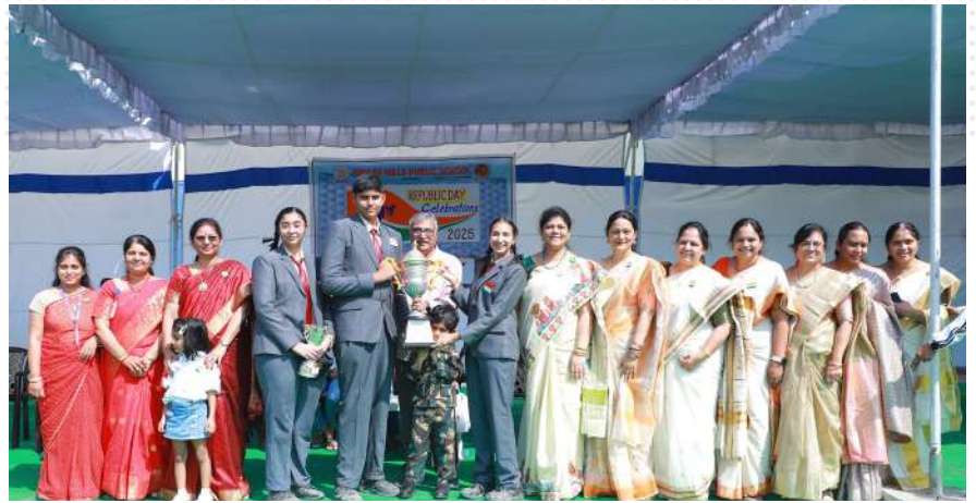
Overall Best Ganga House First Place