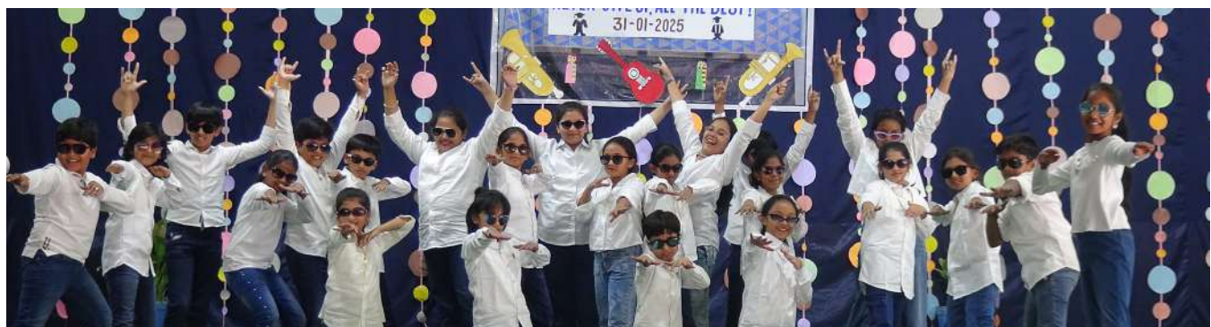
Dance – Jalsa