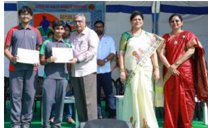
Aryabhata Ganith Challenge-CBSE