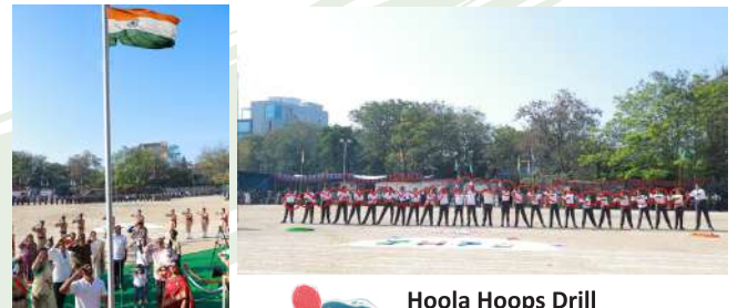
Hoola Hoops Drill