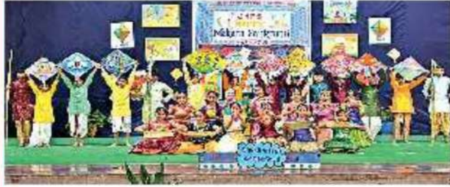
జూబ్లీహిల్స్ పబ్లిక్ స్కూల్లో..

పాఠశాలలో శుక్రవారం సంత్రాంతి సంబరాలు అంబరాన్నంటాయి. విద్యార్థులు సాంస్కృతిక ప్రదర్శనలతో అలరించారు.