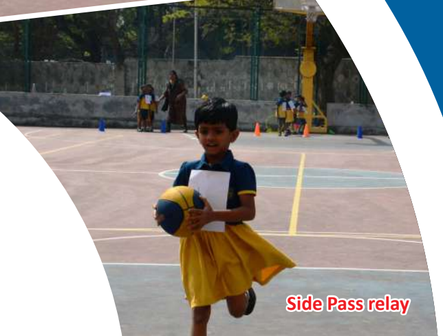
Side Pass relay

It was fun filled and an exciting day both for teachers and students. The winners were awarded with gold, silver and bronze medals along with certificates.