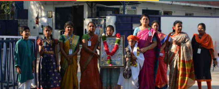
Sadguru Sri Tyagaraja Aradhanotsavam