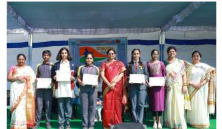
For Outstanding Performance