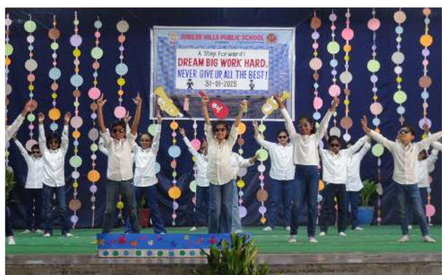
Class 5 - A Step Forward!