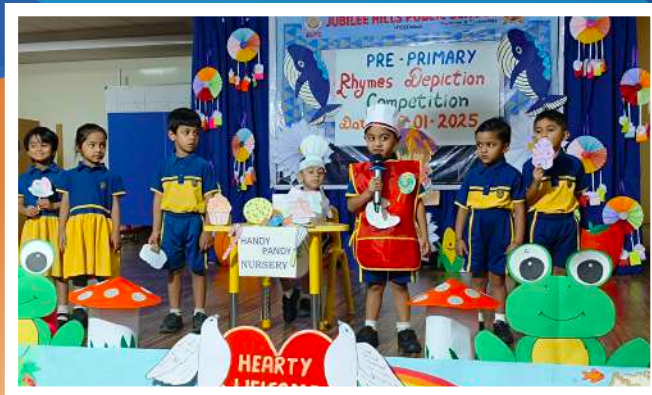
Rhymes Depiction Competition