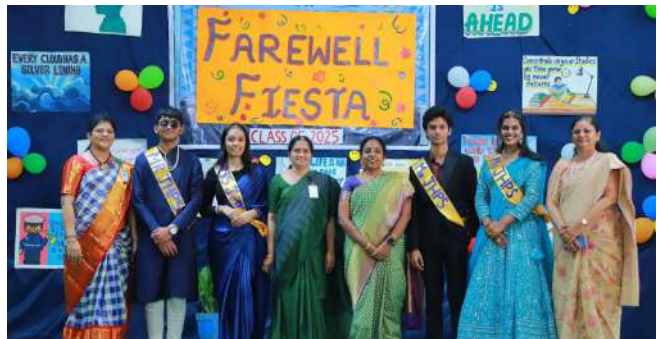
Mr & Ms JHPS

It is the day that signifies both the joy of cherished memories and the sadness of parting ways. It marks the end of a chapter, yet indicates the dawn of new opportunities. A farewell is not just a goodbye; it is a celebration of growth, friendship and the promise of a brighter future.