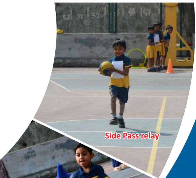
Side Pass relay