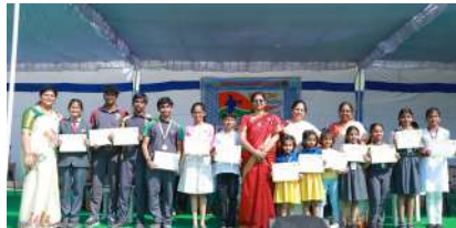
General Proficiency First Prize