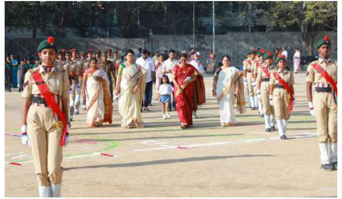
Guard of Honor

Students also participated in Recreational Games and Sports Events, including Relay Races, Mass Drill, and Pyramid Formations, showcasing their athleticism and sportsmanship. Lastly, the most awaited event, the Prize Distribution Ceremony, took place, where students were recognized for their outstanding achievements in academics, co-curricular activities, and sports.