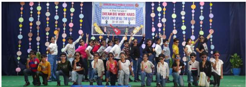
Dance - Sangamam