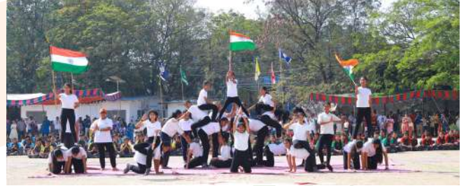
Mass Drill and Pyramids