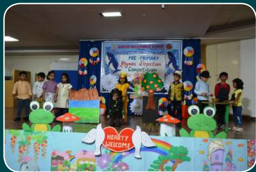
The Planting Song