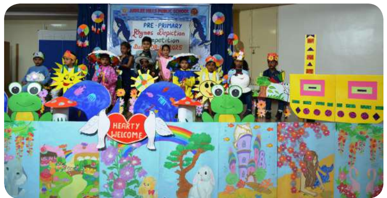
It is a Summer Day Down by The Sea