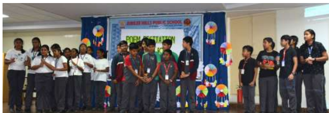
The Spider and the Fly by Mary Honitt