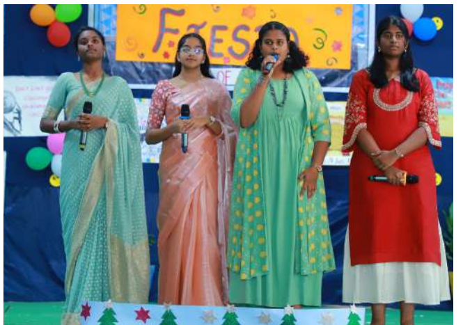
Master of Ceremony