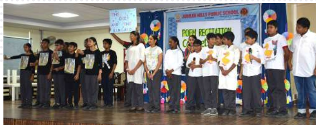
The Duck and the Kangaroo

The winners of the competition were Class 6G-First place, Class 6F-Second place and Class 6H-Third place, recognizing the exceptional creativity and effort of the students. The event was a resounding success, leaving both participants and the audience inspiring and enriching by the beauty of poetry.