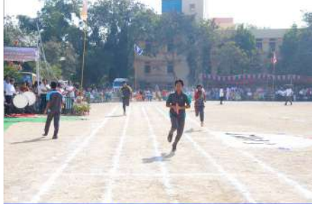
4x100 mts Relay