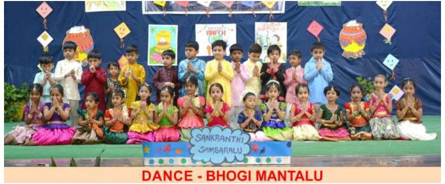
DANCE - BHOGI MANTALU

The festive spirit was further elevated by cultural programmes featuring folk music, dance performances with festive attire and thoughtful messages. National Youth Day was also celebrated to commemorate the birth anniversary of Swami Vivekananda, one of the greatest philosophers and spiritual leaders. As the festival drew to a close, children basked in the joy of flying kite and optimism that Sankranti brings, setting the tone for a year of abundance, peace, and prosperity.