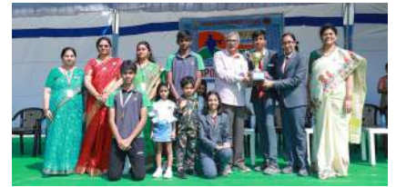
Best House in Sports - Cauvery First Place