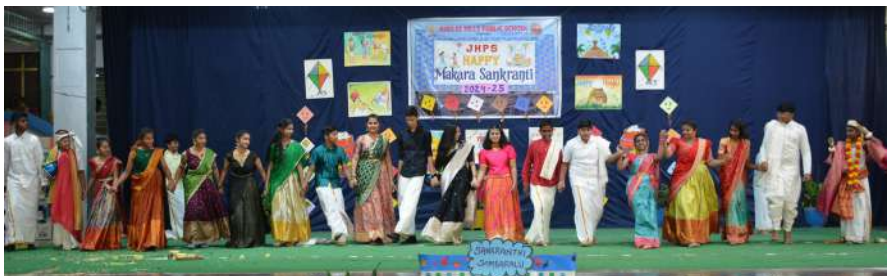
Skit - Sankranti Vaibhavam