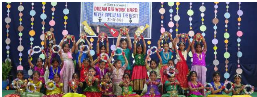
Dance - Medley