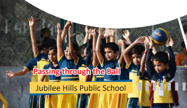
Passing through the Ball