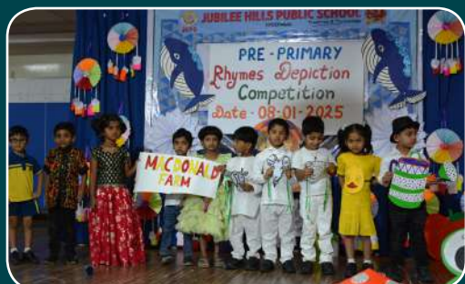
Old MacDonald Had a Farm