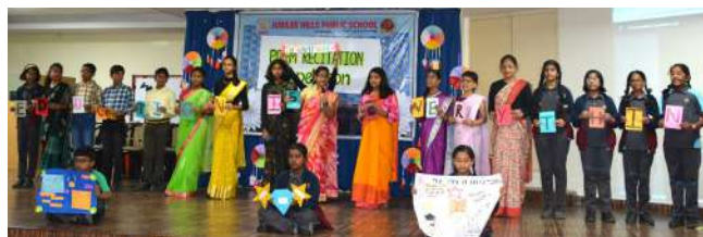
The Star of Education