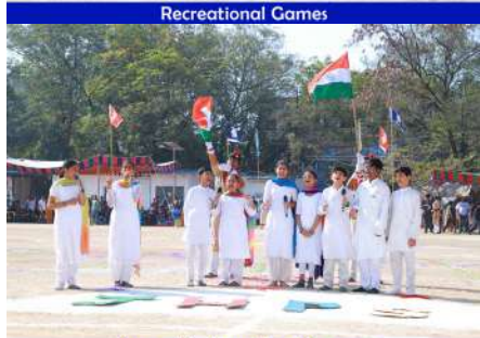
Song - Eedesam Naa Pranam