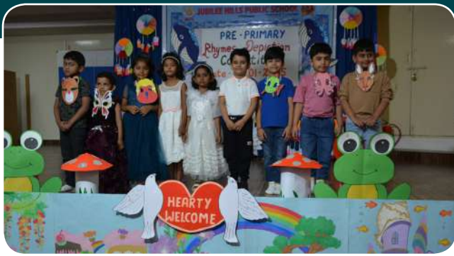
If I Were a Robin in a Tree