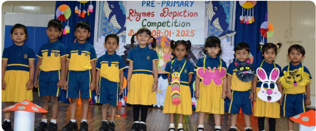
One Finger One Finger