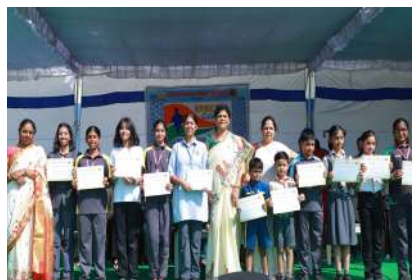
General Proficiency Second Prize