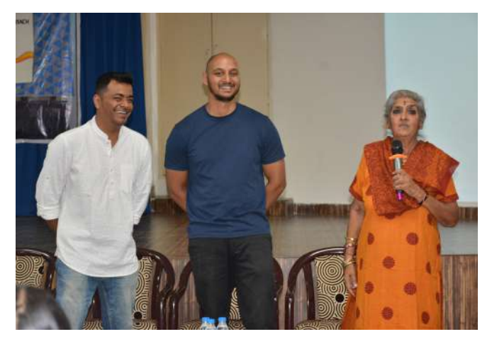
Address by the Chief Guest