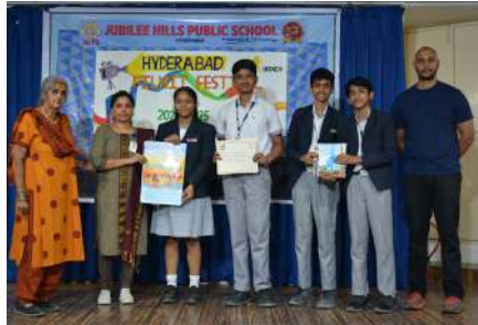
Prize Winners at Filmit Festival